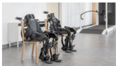
EksoNR - Exoskelett